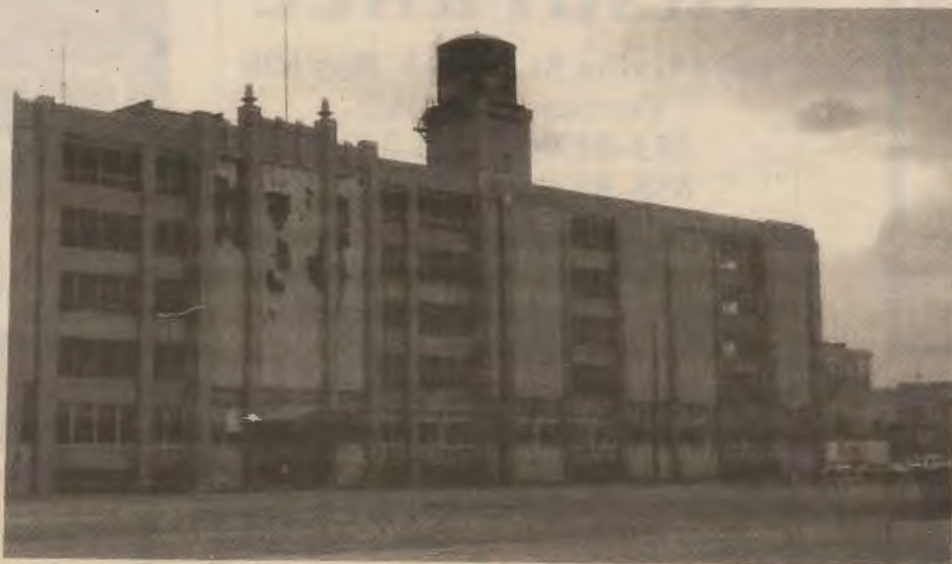
Abandoned shoe factory in downtown Portsmouth is home to the SOGP

Empowerment Zone Money Secretly Spent by SOGP