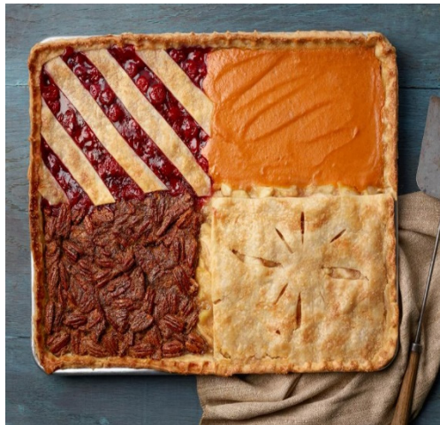
Figure 2. 4-Piece Pie Illustrating Word Problem in (12)

(13) Illustration of word problem in (12)